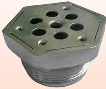
Set for brazing