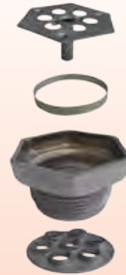
Set for TIG welding